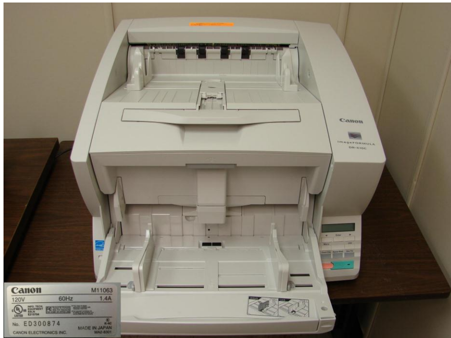
Photograph No. 3 ICC Central Count Tabulator