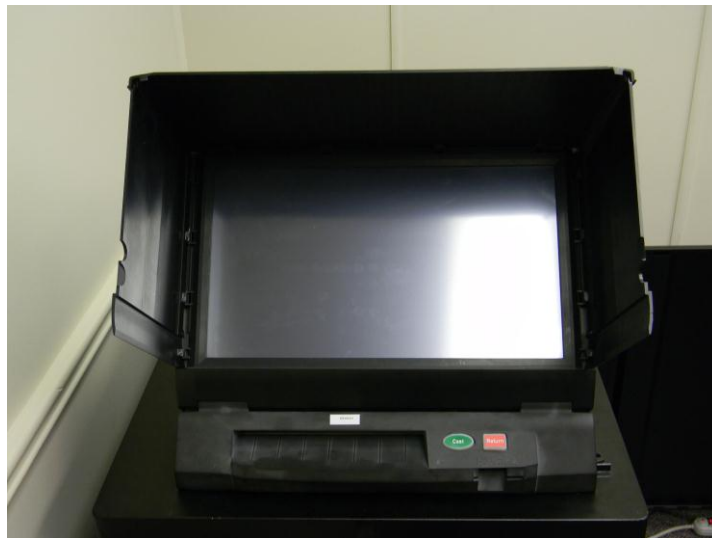
Photograph No. 1 View of ICE Precinct Ballot Tabulator**

The Dominion Democracy Suite ImageCast Evolution system employs a precinct-level optical scan ballot counter (tabulator) in conjunction with an external ballot box. This tabulator is designed to mark and/or scan paper ballots, interpret voting marks, communicate these interpretations back to the voter (either visually through the integrated LCD display or audibly via integrated headphones), and upon the voter's acceptance, deposit the ballots into the secure ballot box. The unit also features a Sip and Puff device or Audio Tactile Interface (ATI) which permits voters who cannot negotiate a paper ballot to generate a synchronously human and machine-readable ballot from elector-input vote selections. In this sense, the ImageCast Evolution acts as a ballot marking device. The binary inputs are interchangeable and may be shared between the ICE and ICP units.