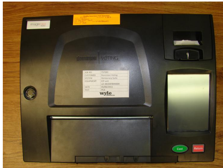
Photograph No. 2 View of ICP Precinct Ballot Counter

The ImageCast Precinct Ballot Counter is a precinct-based optical scan ballot tabulator that is used in conjunction with ImageCast compatible ballot storage boxes. The system is designed to scan marked paper ballots, interpret voter marks on the paper ballot and safely store and tabulate each vote from each paper ballot. In addition, the ImageCast Precinct supports enhanced accessibility voting which may be accomplished via a Sip and Puff device or Audio Tactile Interface (ATI) connected to the ImageCast unit. The binary inputs are interchangeable and may be shared between the ICE and ICP units.