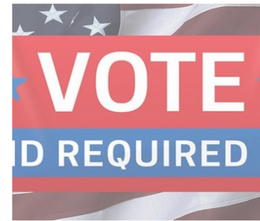
GOP Chairman Touts over 250k people clean from Voter Rolls. False.