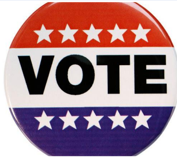
Candidates Names Left Off Ballot During Early Voting of the Primaries. Voting machine issues