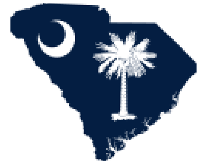
Open Primaries, GOP & SC State Legislature Apathy