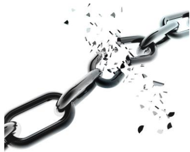
Breaking of Chain of Custody & Seal